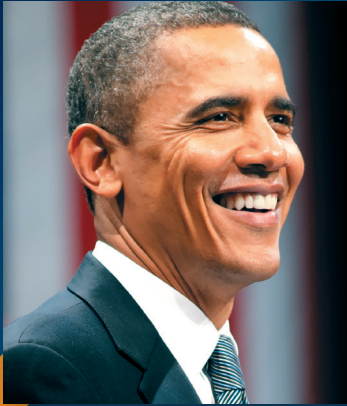
PRESIDENT Barack Obama