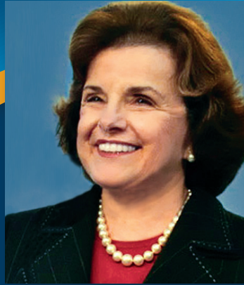
U.S. SENATOR Dianne Feinstein